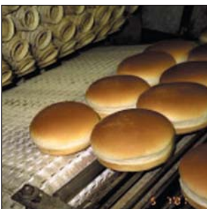
uni Light CR Belt

uni-chains provides the complete solution to all of your conveyance needs/problems from dough conveyors to pallet handling. We have developed products that will exceed your expectations whether you need a cleanable belt, a wear resistant chain or a belt to convey a full load of pallets.