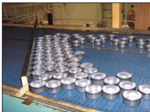
uni SNB M2 Belt

uni-chains provides the complete solution to all of your conveyance needs/problems from can washer to pallet handling. We have developed products that will exceed your expectations whether you need a high speed belt, a wear resistant chain or a belt to convey a full load of pallets.