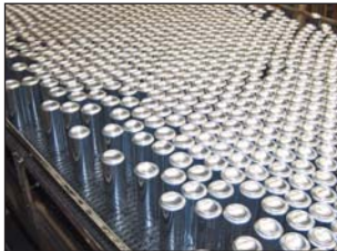
uni Light C Belt