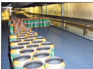
uni M-SNB M2 Belt